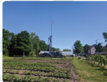
Wilson Streets Urban Farm well installation 2021

The cost of installing a water line and connecting it to the municipal supply is a huge financial and logistics barrier. This also poses a planning and zoning issue as well as there is no designation for urban farms and community gardens so they are zoned as vacant residential land. San Francisco currently offers a grant designed to help urban agriculture projects and community gardens better manage their irrigation water use. The program offers a one-time waiver up to $12,000 for the installation of a new dedicated irrigation water service and meter for eligible projects that will be maintained for a minimum 10-year span. One way to credit urban farms for water usage could be based on the square footage of previous surface on the farm.